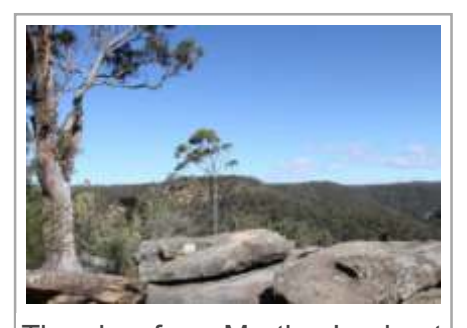
The view from Martins Lookout